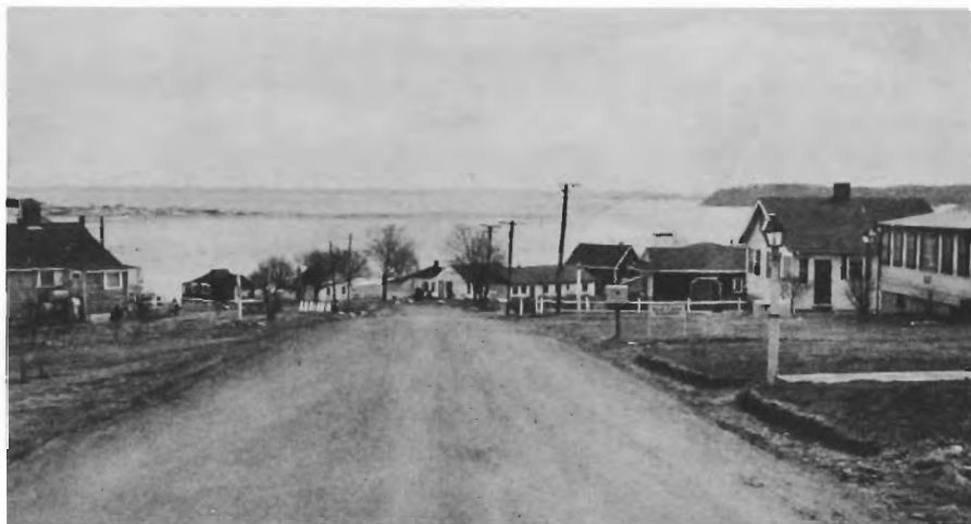
Ipswich Bay from North Ridge Road, Ipswich, Massachusetts - c. 1950.