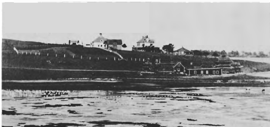
Looking north from Clark Pond toward the Clark residence. Date taken unknown, probably early 1900's.

Mr. Clark developed a gunning pond, which is now Clark Pond, by damming up the marsh at the foot of the hill and building gunning blinds along the shore. He built in the side of the hill underground living quarters where a party of sportsmen could be accommodated. There was a flock of wild geese, sometimes as many as several hundred, kept in pens and released as decoys when the migrating geese flew overhead. During the winter, ice blocks would be cut from the pond for use during the summer months and stored in an ice house, which stood on shore near the Bowdoin Road area.