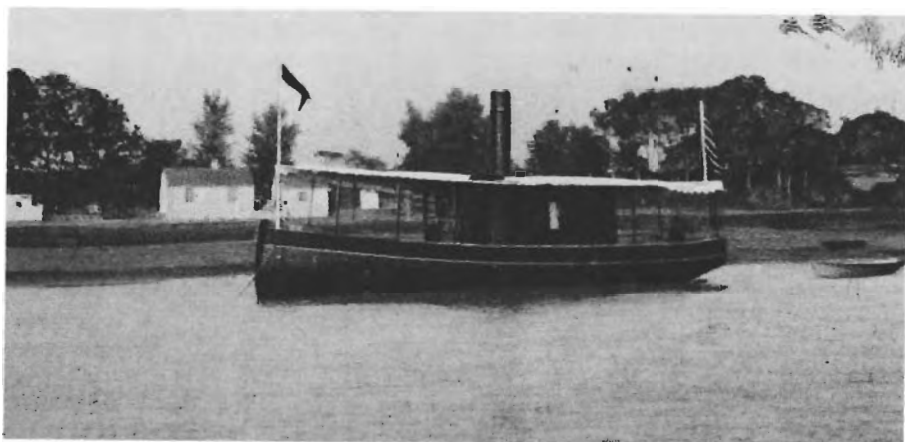
Steamer "Carlotta", Grape Island. Date taken unknown.