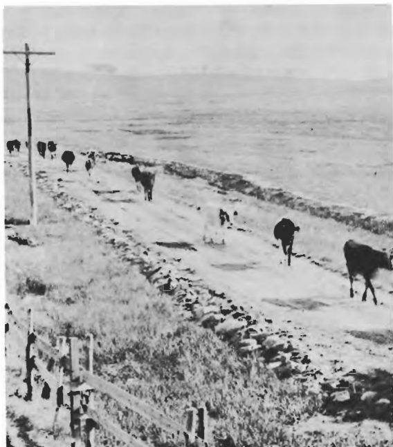
Cows on Jeffrey's Neck Road. Date taken unknown.