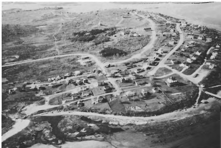
Aerial View of Bowdoin Road area - c. 1960.