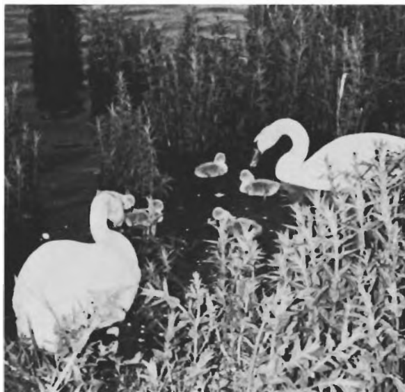
The family of swans on Clark Pond